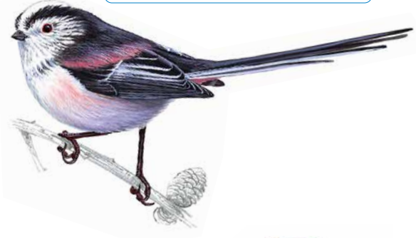
Long-tailed tit ++++ +++++ +++++ +++++