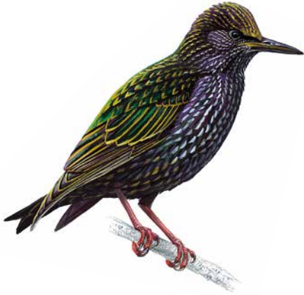
Starling ++++ +++++ +++++ +++++