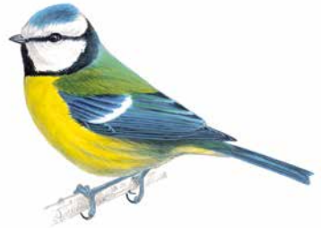
Blue tit ++++ +++++ +++++ +++++