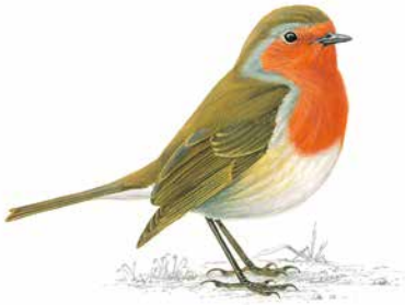
Robin ++++ +++++ +++++ +++++