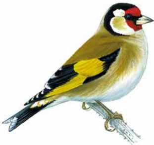
Goldfinch ++++ +++++ +++++ +++++