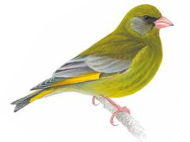
Greenfinch ++++ +++++ +++++ +++++